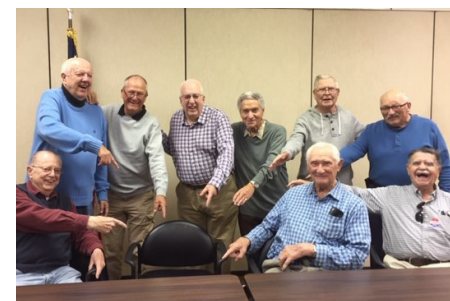
The Sandel Men's Club is waiting for you to join them!

Sandel membership is open to those aged 60+ who reside in Rockville Centre and the surrounding communities. For more information please call, visit www.rvcny.gov/senior-citizens or just drop in. You will receive a warm welcome.