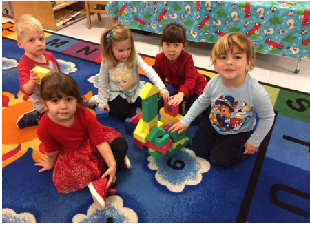
Cooperative play is part of the learning environment in our Pre-School classes.