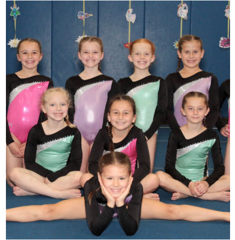
Come watch these fierce competitors as they participate in the Evolution Gymnastics League.

The Recreation Department's Summer Basketball League hosted over 135 teams in 2019. The Recreation Department will be accepting team rosters and fees beginning March 23rd. Complete roster and full fee must be submitted at time of registration.