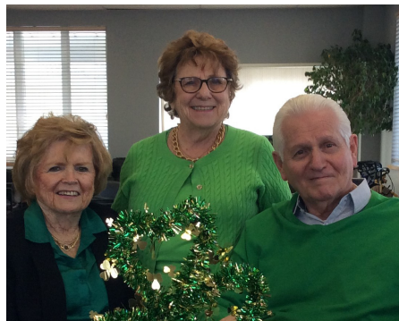
A St Patrick's Day celebration in March is one of many special events at Sandel.

Packed with programs, activities and services, the Sandel Center is the place to be for active older adults from Rockville Centre and the surrounding communities. With countless opportunities for fun and friendship, members enjoy volunteerism, trips, parties, fitness, life-long learning, creative arts and much more.